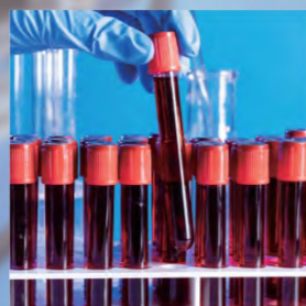
Blood pressure monitoring