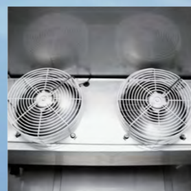
Blower pressure monitoring

There are following 11 selectable pressure units: bar, mbar, kPa, kgf/cm 2 , mmHg, cmH 2 O, Ozf/in 2 , psi, inHg, inH 2 O, ftH 2 O. This unit features data save and adjustment, automatic turn-off, connecting with PC to read and export the data with a USB wire.