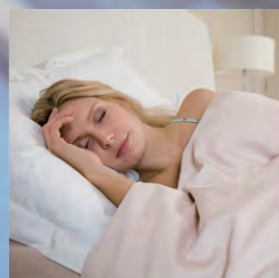
Respiratory pressure monitoring