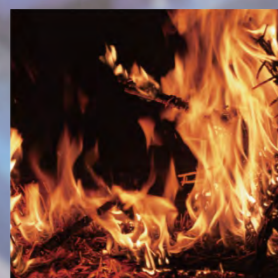
Gas ratio control during combustion