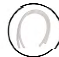
Translucent silica gel hose